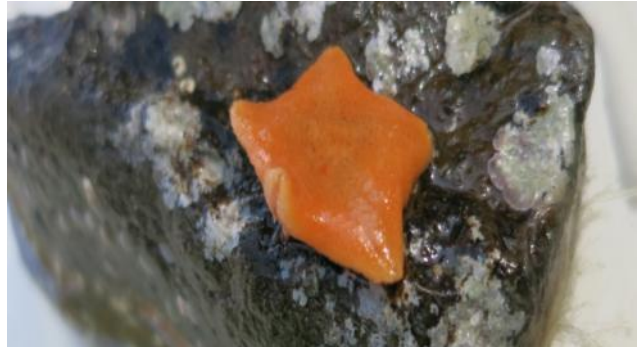
In the Hartz Mountains there was orange dotted all through the habitats from flowering forest trees to heath in the moorlands and the mosses and lichens in the wet alpine areas.