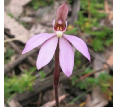
Pink Finger Orchid

covenanted property near Port Sorrell – Rubicon Sanctury. This is an endangered forest community and a hotspot for orchids, 45-50 different species. Also a home to a nationally threatened dollybush, Cassinia rugata . Learning the life cycle and needs of the orchids and other unusual plants will ensure the populations of these priority species are sustained and improved. The fire management regime requires a delicate balance between frequency and the season of burn.