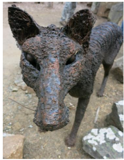
Tasmanian Tiger sculpture

The quarry site has been transformed into a safe area with local fauna planted in a carefully designed scree slope, sculptures of Wedge-tailed Eagle, Tasmanian Tiger and dinosaur, a waterfall and vegetated pond.