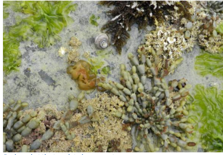
Rock pool at the tesselated pavement

in finding a semi slug at Lake Osborne (a glacial lake in