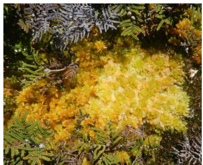
Even the Pineapple Candle Heath on Mount Wellington had an orange presentation for us.