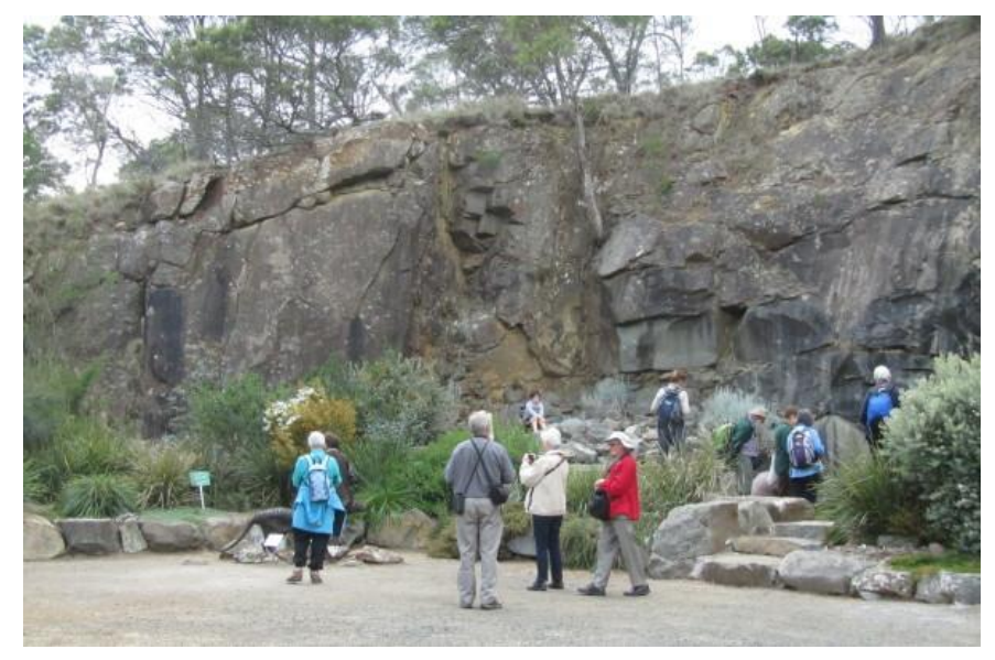
South-eastern Tasmanian species planted on scree slope in former quarry.

The Display Gardens occupy about half a hectare, and have been developed on a gentle sunny slope facing SW. Display beds have been planted to simulate natural plant communities growing on dolerite in the south-east and some of the rare and plants of eastern Tasmania. The landscaping features many local rocks and logs, which give a natural setting, and the gardens merge into the surrounding grassy woodland.