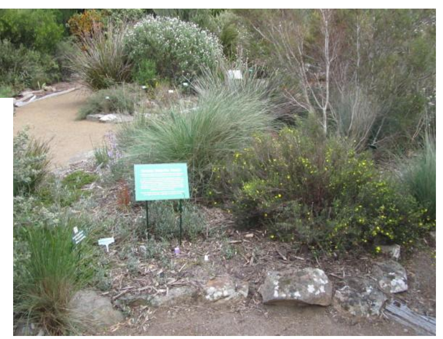
Grassy Dolerite Heath community with Tussock Grasses Poa sp. and Guineaflowers Hibbertia sp.

The quarry site has been transformed into a safe area with local fauna planted in a carefully designed scree slope, sculptures of Wedge-tailed Eagle, Tasmanian Tiger and dinosaur, a waterfall and vegetated pond.