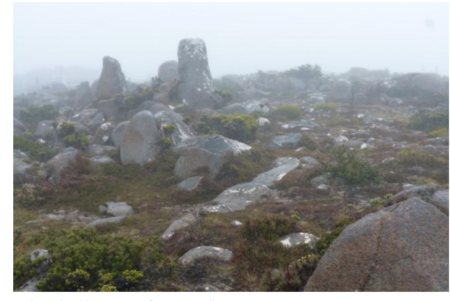
Dolerite boulders on top of Mount Wellington

surface of the sandstone. Folding, faulting and weathering has created the big ranges of Mount