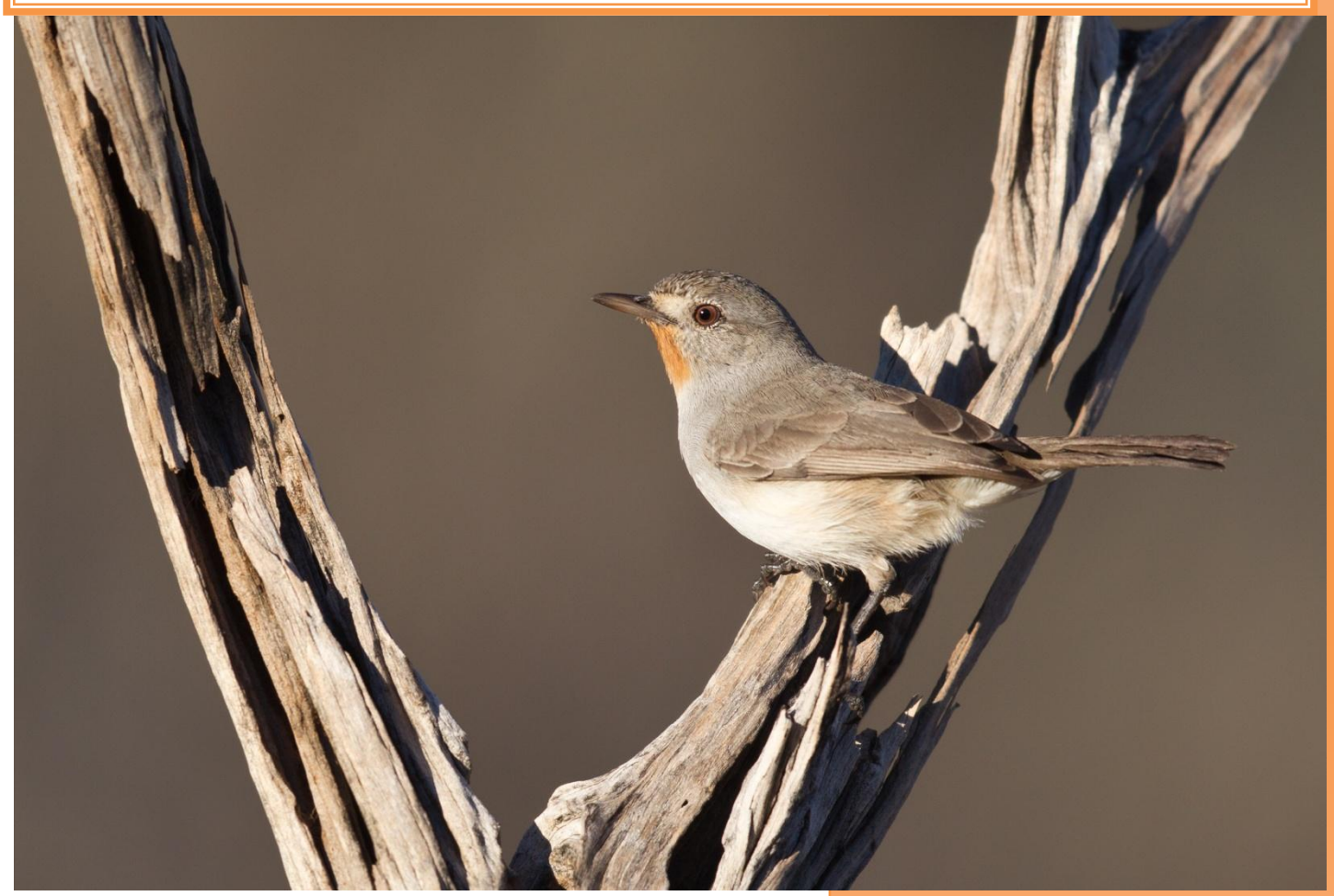
This beautiful male Redthroat was photographed 4.4km West of Flynns Grave on the South side of Larapinta Drive by Mat Gilfedder. His song is a rich and varied, a bit like a Reed Warbler but softer. Hear it at - <a href="https://soundcloud.com/mat-gilfedder/redthroat-male/s-XXV98">https://soundcloud.com/mat-gilfedder/redthroat-male/s-XXV98</a>

Meetings are held on the second Wednesday of each month (except December & January) at 7:00 PM at Higher Education Building at Charles Darwin University. Visitors are welcome.