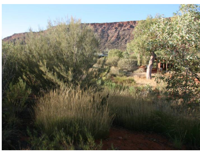
"General view of Sand Country taken in 1997" and "The Sand Country today taken from the claypan towards Nocturnal House"

The Desert Park is a Category 'A' Botanical Garden. To be so designated certain requirements need to be met. All the plants are mapped and positioned on a GIS database; all plant identifications are confirmed by the Herbarium; all seeds or cuttings are collected within a radius of 40km from Alice Springs (Wild Provenance) and all plants have vouchered Herbarium Specimens, so their origin is documented.