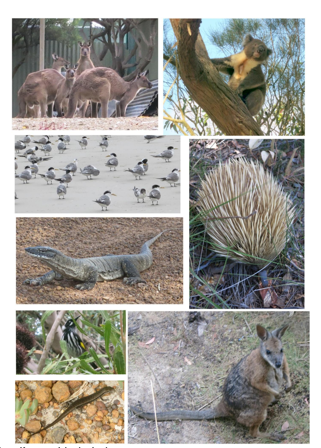
Some Kangaroo Island animals . Clockwise from top left – <u>Kangaroo Island Kangaroo</u> <u>Macropus fuliginosus subsp. Fuliginosus (endemic subspecies)</u> someone was feeding these; <u>Koalas</u> were introduced to KI in the 1920s, their population now needs to be controlled: <u>KI Short-beaked Echidna</u> race <u>multiaculeatus</u> which is smaller and paler than the mainland race; <u>Tammar Wallaby</u>, common around the house we rented at Vivonne bay, regarded as a farmland pest; <u>Garden Skink Lampropholis guichenoti</u>; <u>New Holland Honeyeaters</u> loved the Banksias in Stokes Bay Bush Garden; <u>Rosenberg's Heath Goanna</u> <u>Varanus rosenbergii</u>. We saw several of these on roads, alive and dead; part of a big flock of <u>Crested Terns</u> at Vivonne Bay. Taken on a recent holiday