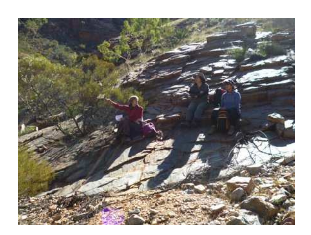
Field Naturalists in their natural habitat. Hugh Gorge Trip

Please read these minutes prior to attending the meeting. The AGM will be followed by a brief monthly meeting and then member's night. Bring something interesting to share!