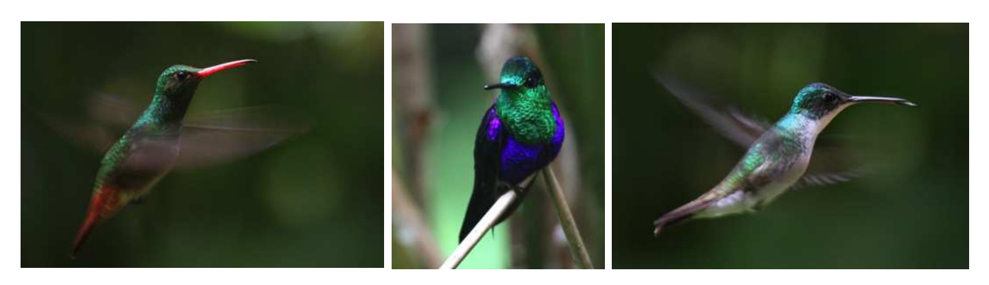
Hummingbirds from left: Rufous-tailed Hummingbird; Green-crowned Wood-nymph; Andean Emerald

Where else in the world can you go and swim with penguins, seals and....hammerheads?