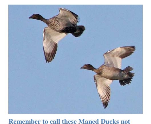
Wood Ducks.

A Stilt with a new name.