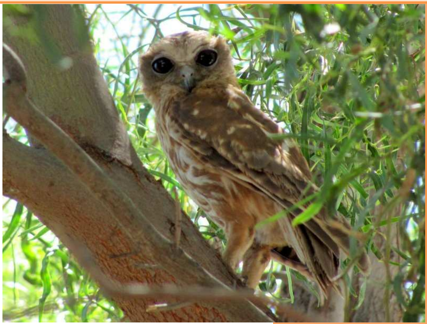
A beautiful adult Boobook Owl, one of a family of three, who tried to find shade roosting in Barb's garden during some of the hottest days of Summer.

Meetings are held on the second Wednesday of each month (except December & January) at 7:00 PM at Higher Education Building at Charles Darwin University. Visitors are welcome