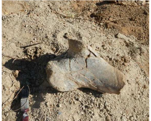
Bones from the 2012 dig

Sunday morning I had the chance to go on Peter Latz vegetation walk. He brought the 3 aspects of the weekend together with the site and what lives here now; the dig with the remains of some species of animals; why and what caused the vegetation changes and life extinctions.