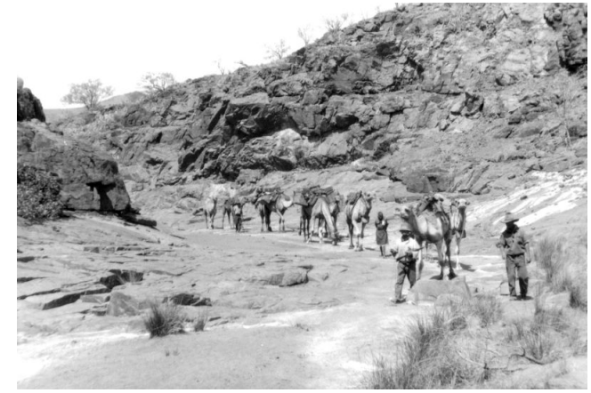
Oparinna Gap - Musgrave range 1933

In all, this remarkable man collected and prepared some 2500 to 3000 specimens, meticulously recording his travels and finds on over 5000 negatives. He collected (and as often as not, ate) examples of mammals that have since become limited in their range or have disappeared from the scene entirely, such as the Rat Kangaroo, Mala, Numbat, Lesser Bilby and the Burrowing Bettong. He encountered well known 'characters' from central Australia at places such as Angas Downs, Tempe Downs and Coniston. Aboriginal people collected creatures for him, and their names, too were noted down with their photographs.