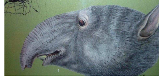
Palorchestes reconstructed: Marsupial Tapir

The skull of Palorchestes had small eye holes and a shortened nasal bone in front of a broad facial area with a wide hole for blood vessels and nerves to pass through. These features often indicate a trunk-bearing animal. Taken together with its clawed feet, this suggests Palorchestes may have been a sloth-like creature or an early termite eater.