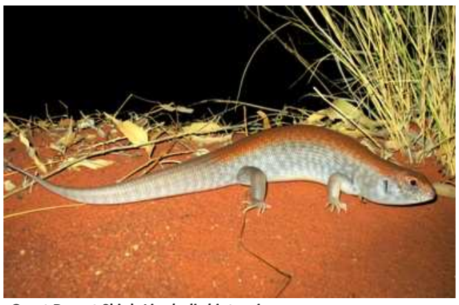
Great Desert Skink Liopholis kintorei