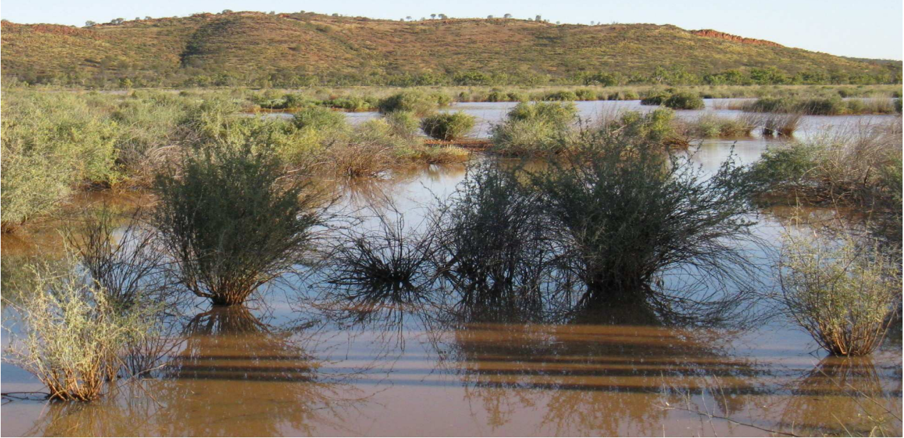
Conlin Lagoon was full of water last time we visited in May 2010.