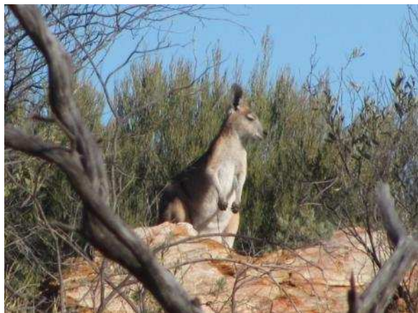
Euros watched us cautiously

From the top of the ridge – accessible after a short scramble from the path that leads off beside the Christian School – we were treated to the sight of most of Alice Springs shrouded in a layer of smoke. In the opposite direction, Mt Gillen looked splendid across the valley.