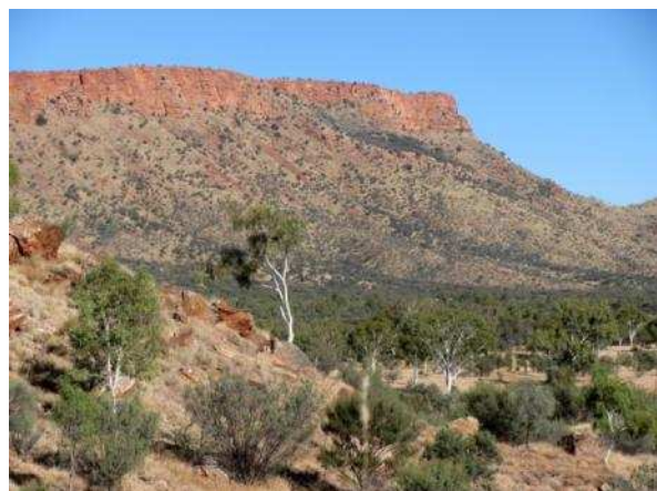
Mt Gillen from the top of the ridge

As we wandered along we saw a number of curious Euros that were happy to sit and watch us watching them. We also spotted some bird life: a Brown Falcon that swooped down and flew slowly above us, Spiny-cheeked Honeyeaters, Crested Pigeons, Grey-crowned Babblers, Australian Ringnecks, Rufous Whistler, Black-shouldered Kite, Mistletoebird, Red-capped Robin, Brown Songlark, and Willie Wagtails.