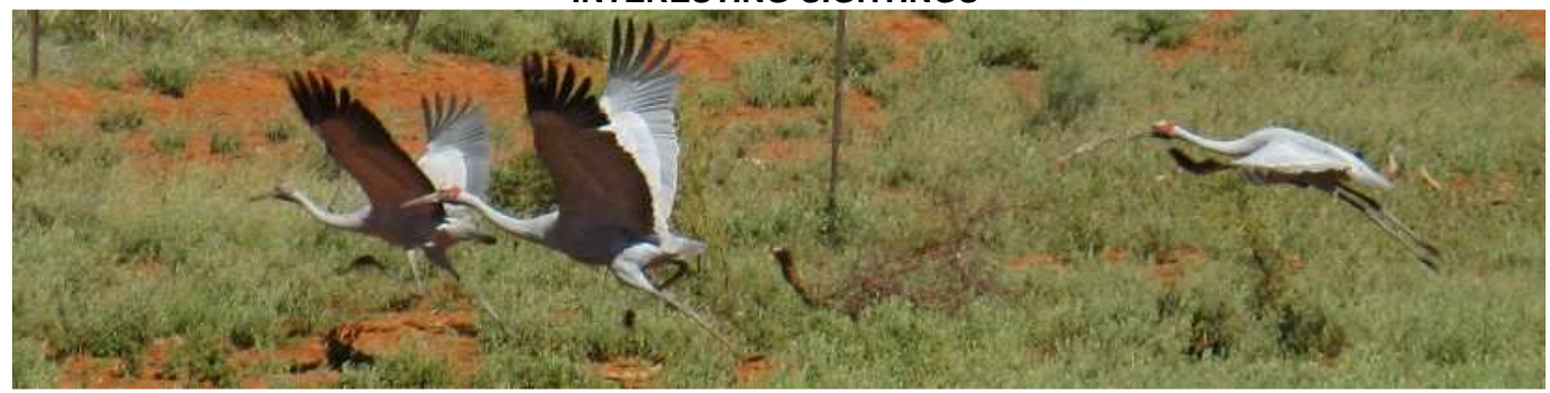
Please let Barb Gilfedder know of any interesting birds or animals seen locally for inclusion in this list.