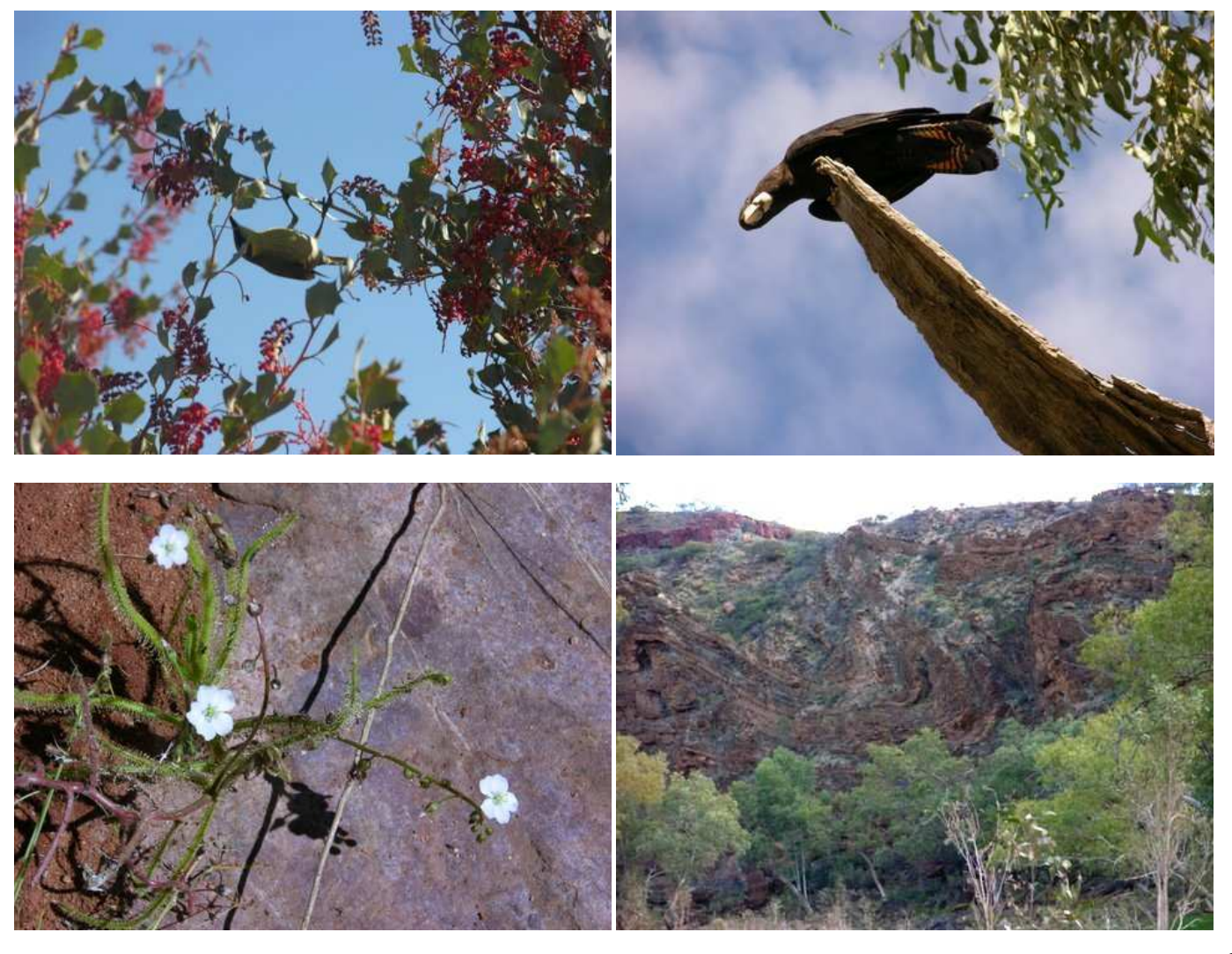
\label{lem:photos} \textbf{Photos by James Armstrong} \ \ \textbf{-} \ \text{Clockwise from top left} \ - \ \text{Grey-headed Honeyeater enjoying } \ \textit{Grevillea wickhamii} \ \text{blossoms;} \\ \textbf{Don't you point that camera at me} \ - \ \textbf{Red-tailed Black Cockatoo;} \ \textbf{Drosera flowers;} \ \textbf{Interesting geology at Ruby Gorge.} \\ \end{cases}