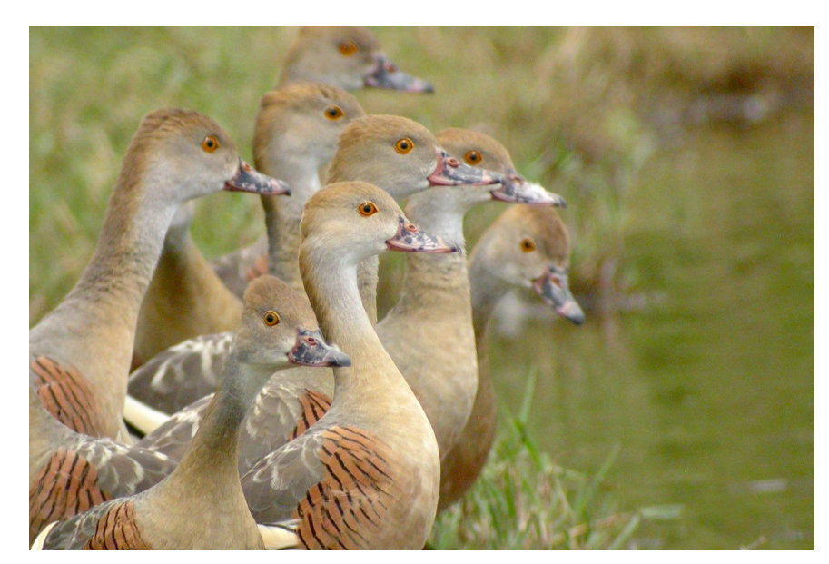
Plumed Whistling Ducks

A flock of over 100 Plumed Whistlingducks arrived at the Alice Springs sewage ponds after the January rains. Many of them are still here in the middle of February. They are beautiful birds with long necks and a spray of creamy plumes over each wing. They whistle when they fly.