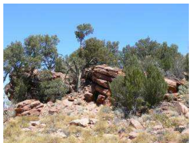
Figure 4 Callitris glaucophylla

There is a lot of Grevillea wickhamii (none in flower on this occasion) and some Gossypium species, some with their large showy flowers.