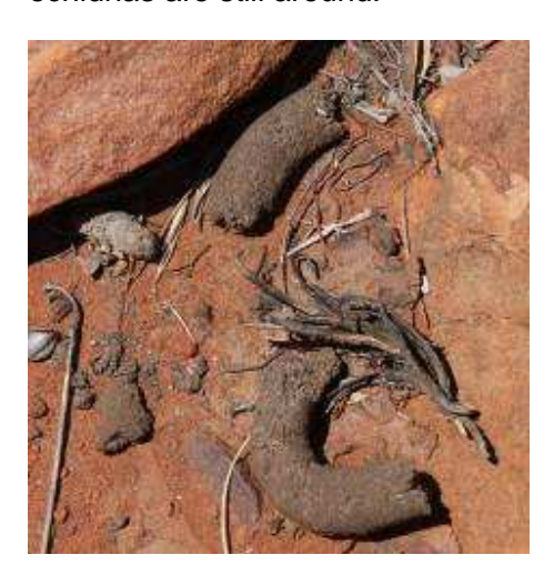
Figure 3 Echidna scat

We saw one Euro and lots of dung, but no sign of the wallables. Echidna scats (cylindrical, with termite casings, soil and pieces of grass), were abundant on the ridge and some fresh scratchings showed that the echidnas are still around.