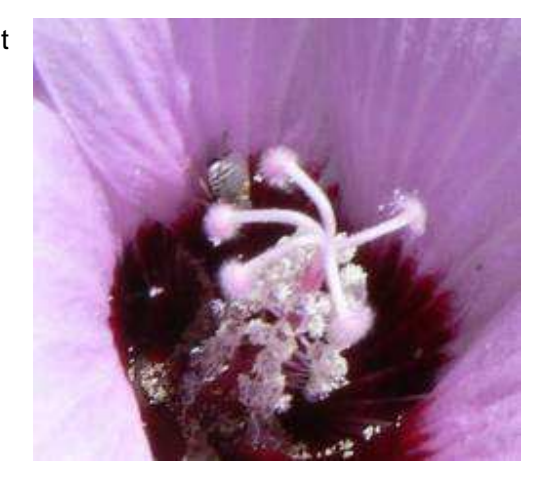
Figure 5 Gossypium sp. with detail showing native bee getting nectar

Not much was around, only the ubiquitous Spur-throated Plague