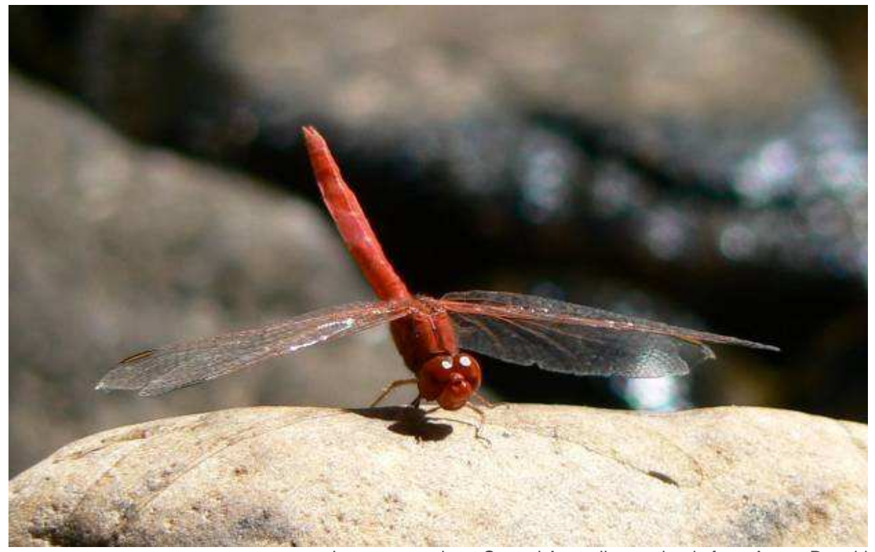
Learn more about Central Australian wetlands from Angus Duguid and Bob Read at this month's Field Nats meeting

Scarlet Percher (Diplacodes haematodes), Photo Bob Read