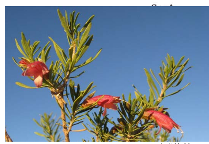
Barb Gilfedder Eremophila latrobei