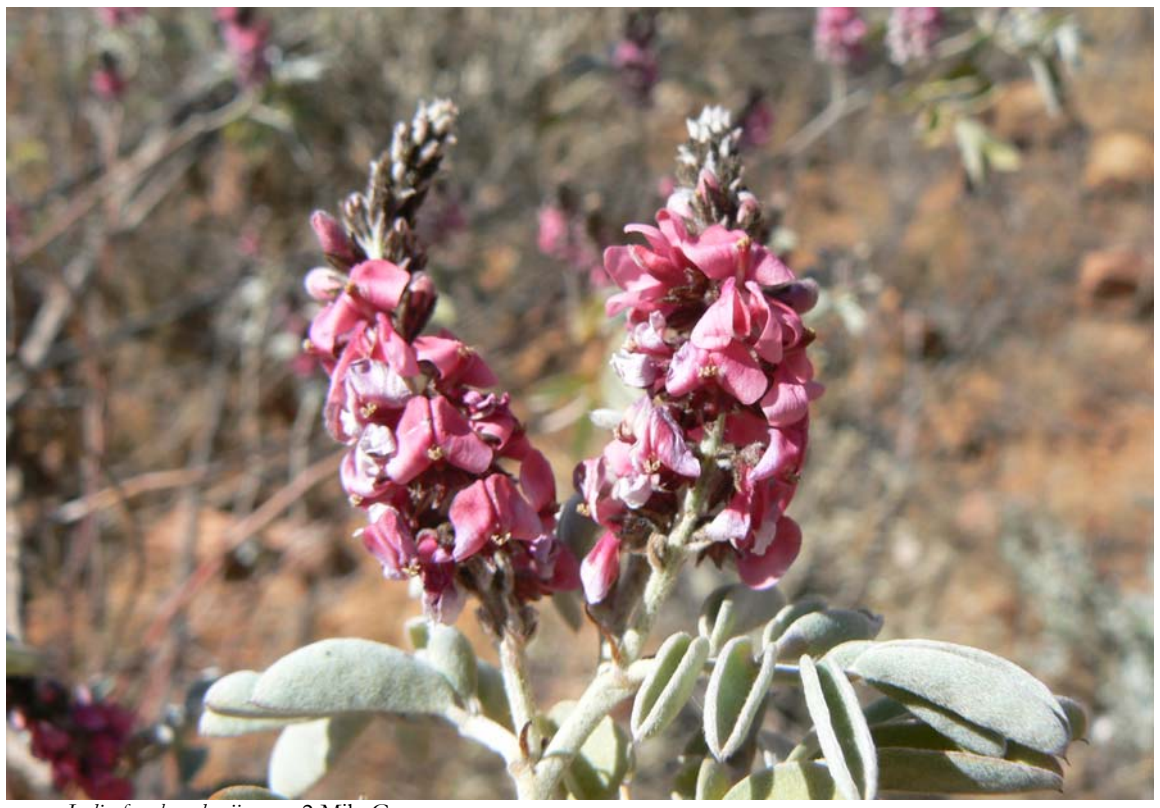
Indigofera basedowii, near 2 Mile Gap