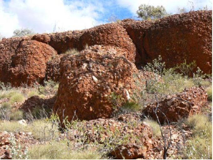
Figure 2 Cemented colluvium in the saddle.

This is even more confused. The "red rock face" is in fact cemented colluvium, (see photo below) and a casual inspection shows that it is far younger than the old rocks of the Amadeus Basin.