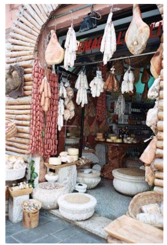
Parma ham, and mozzarella, Norcia

Each day for 7 days we walked 13-17 km, carrying only day packs with Aqua "no-gas", picnic lunches of mozzarella, Parma ham, crusty bread, fruit and pilfered pastries from the over laden breakfast bars of the hotels. We were relieved of the portage of our heavy bags as that was nicely taken care of by Inntravel's connections.